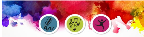
Expressive Arts Therapy

“The arts heal and further all forms of therapeutic practice by giving the psyche opportunities to treat itself through creative expression”